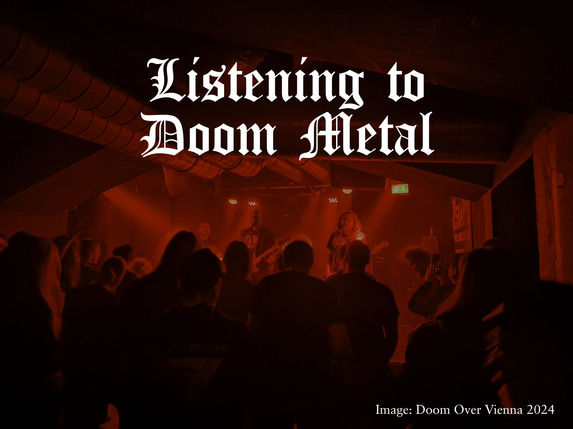
Image: Doom Over Vienna 2024